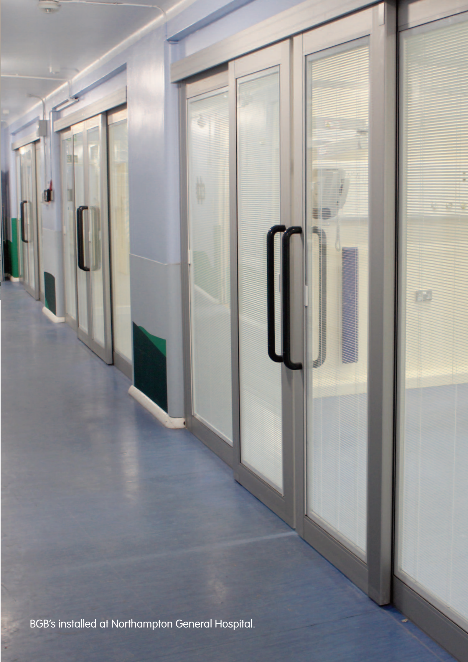
BGB's installed at Northampton General Hospital.